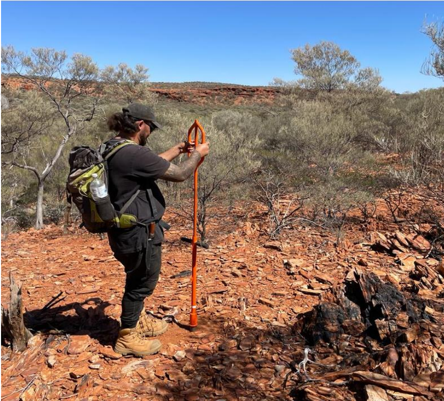
Photo 1: Bellavista field crew deploying seismic phones at the Brumby Project.